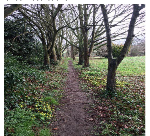
Spring flowers in the churchyard